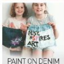
PAINT ON DENIM