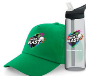
MASTER BLASTERS KIT